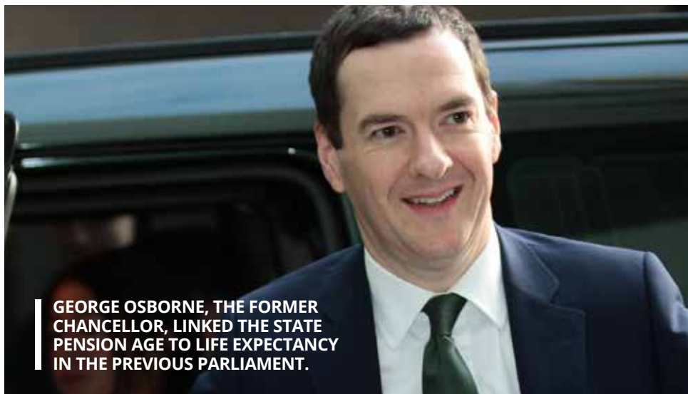
GEORGE OSBORNE, THE FORMER CHANCELLOR, LINKED THE STATE PENSION AGE TO LIFE EXPECTANCY IN THE PREVIOUS PARLIAMENT.

Planning to prevent the financial equivalent of climate change