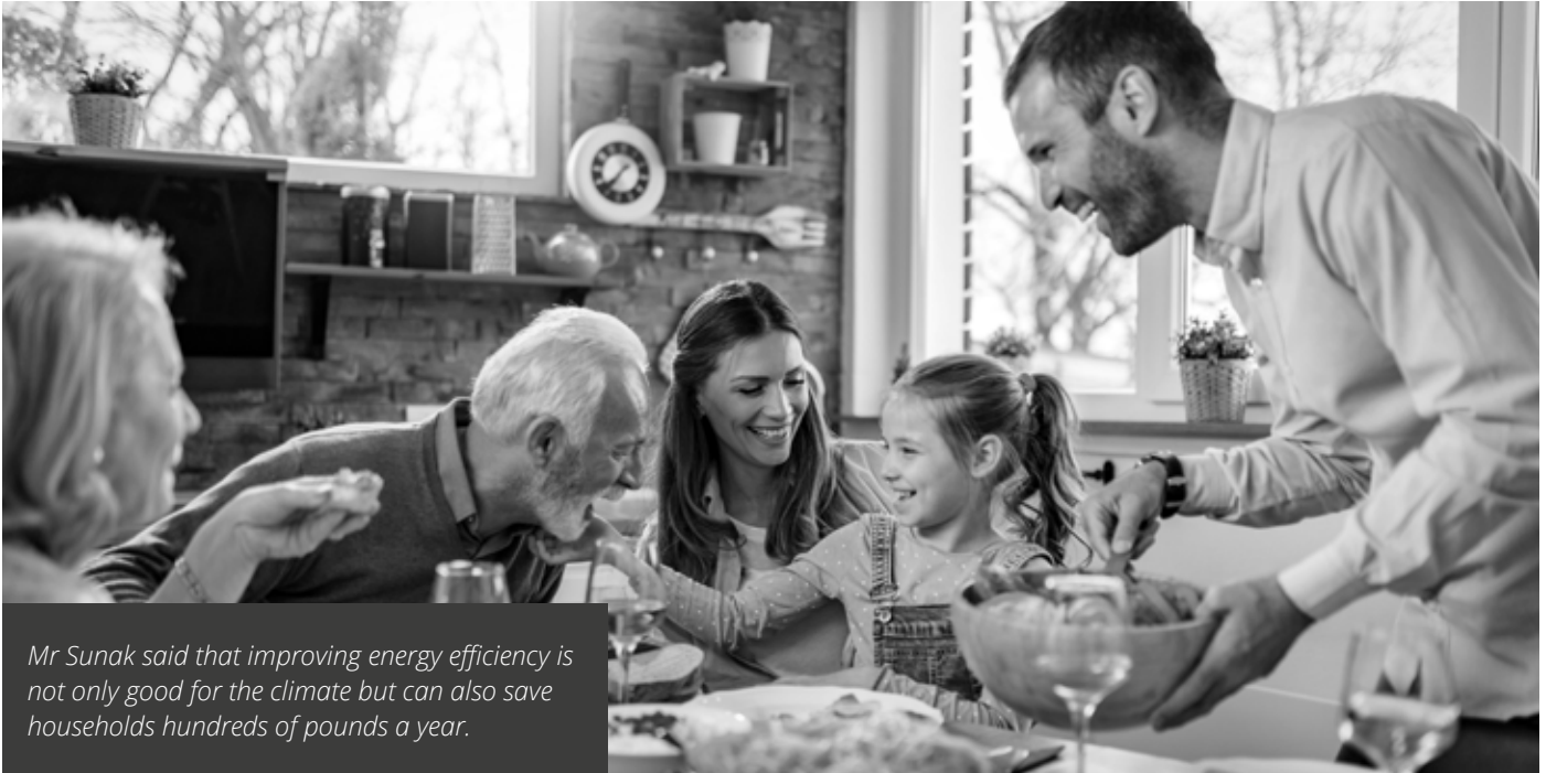
Mr Sunak said that improving energy efficiency is not only good for the climate but can also save households hundreds of pounds a year.